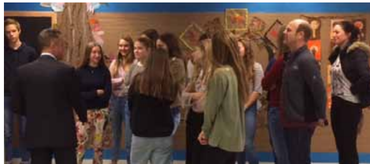
Belgian exchange students.